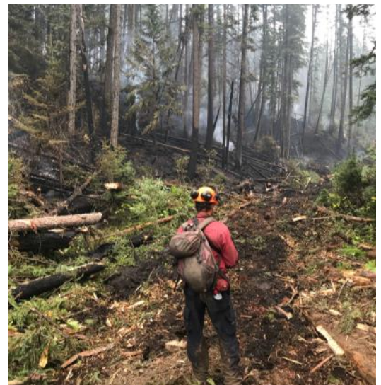
A crew member on the fire east of Young Lake (C42331). This fire is currently Under Control.