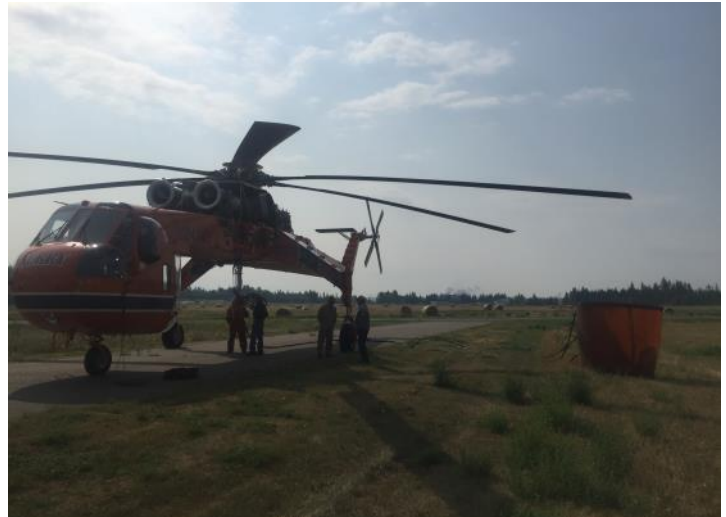
A helicopter and bucket that was being used today on the Narcosli Creek Fire (C12302)

The BC Wildfire Service has been conducting “burn out” operations on various fires. Burn-off operations are a key tactical practice to control and manage the fires currently on the landscape. These operations are carefully planned and monitored by highly skilled Fire Behaviour Analysts and only performed when weather is favourable. Planned ignition operations enhance the overall safety, efficiency and effectiveness of fire management objectives by reducing the amount of fire line requiring fire suppression through direct attack techniques. Often times, direct attack has limited effectiveness, especially on larger fires due to lack of available water, unsafe conditions, inoperable terrain or extreme fire behaviour. These burn-off operations do temporarily increase the amount of visible smoke in the air which can be concerning for people in the area, however the BC Wildfire Service would like to reassure the public that these operations are conducted safely, and only when the operation will provide a significant advantage to fire suppression on the landscape.